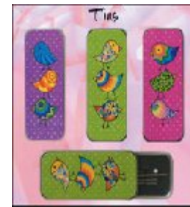
Needle Slides from Just Nan