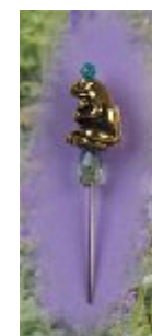
Charm Pins from Just Nan *Hummingbird *Sparkling Bee *Ladybug *Bunny *Frog Prince