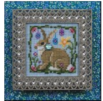
Dew Drop from Just Nan