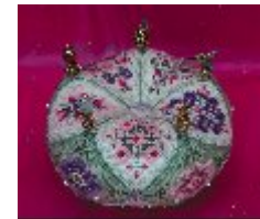
Floral Fifteen from Just Nan

silk, beads and charms. Read more about it on the website.